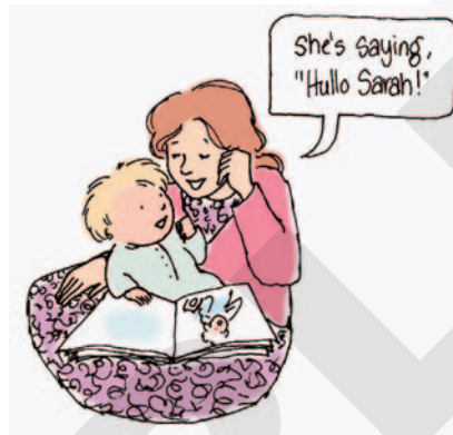
Use gestures and pantomime.

When necessary, rephrase the text to simplify the language and to emphasize key words that are not mentioned. For example, the text of this book does not mention the word "shoe."