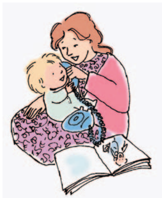
Use props and real objects.